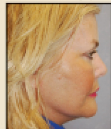
After Face Lift