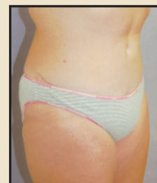
After Tummy Tuck